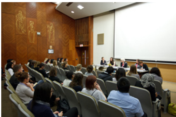
Public Health Alumni Association Spring Speaker Panel